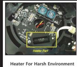
Heater For Harsh Environment