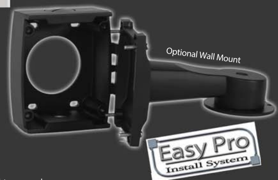
Optional Wall Mount