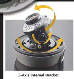
3-Axis Internal Bracket