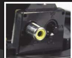
Extra Video Out & Joystick OSD Controller